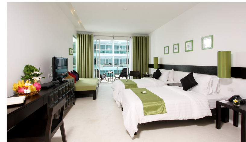
DELUXE POOL ACCESS