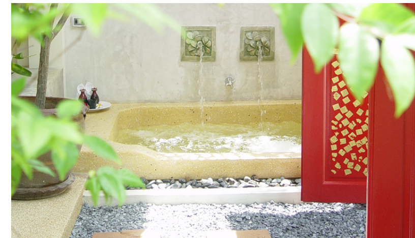
DELUXE POOL VIEW