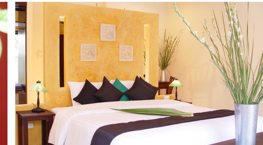
DELUXE POOL VIEW