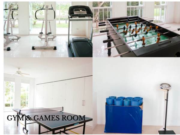
GYM & GAMES ROOM